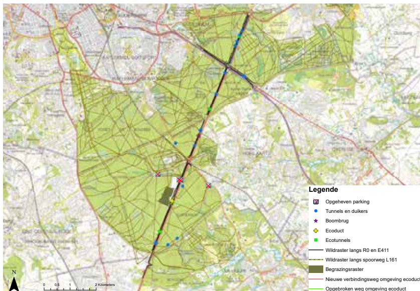
Life project map of achievements (©Life+OZON)

→ The OZON project aims to reconnect ecological hotspots and the habitat of different target species through the realisation of infrastructure (ecoduct, eco tunnels and eco grids), with elaboration from study to construction included in the project.