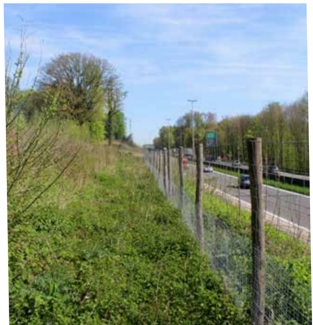
Eco grid along the R0

The height of the grid varies from 1.8 to 2 metres. The grid consists of a fine-mesh grid (1*4cm) at the bottom and a coarse-mesh grid (10*10cm) at the top. The grid was dug 20 cm deep to keep away species such as foxes and badgers. It is equipped with 34 roe deer and 34 badger gates that allow animals to get back to the forest side in the event they end up on the road side. The grid is also locally equipped with plastic amphibian screens that guide salamanders, frogs and