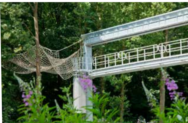
Nets connect the tree bridge with the crowns of the neighbouring trees

A tree bridge is a kind of walkway for small tree-dwelling mammals such as squirrels and pine marten. These species naturally move through high