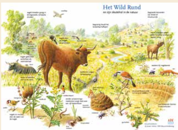
Key role of the wild bull

A herd of eight Scottish Highlanders grazes about 24 hectares (or 48 football fields) of grassland, brushwood and forest on the west side of the ecoduct. These cattle survive year after year all on their own in nature. They keep the landscape half open by pruning woody crops, and eating and trampling during the germination phase. By opening the closed turf, they also stimulate the development of all kinds of aromatic and woody crops. They spread seeds through their fur and manure. Their droppings don't contain any medicines, meaning mushrooms and dung beetles can make the most of them.