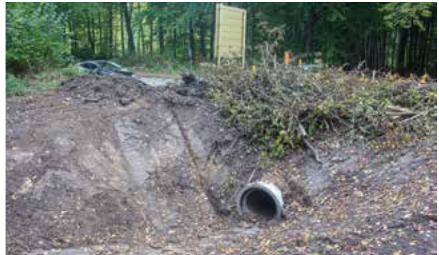
Tunnel Bundersdreef

In 2016 and 2017, two fauna tunnels were realised as a spin-off of the OZON project. These were financed and built as compensatory measures of grid operator