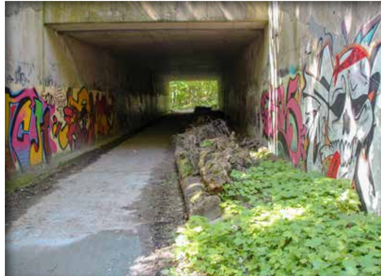
Flossendelle tunnel

Tunnels with such dimensions are aimed at medium-sized mammal species such as mustelids, but also amphibians, reptiles, bats and ground beetles. Stump barriers provide cover for smaller target species.