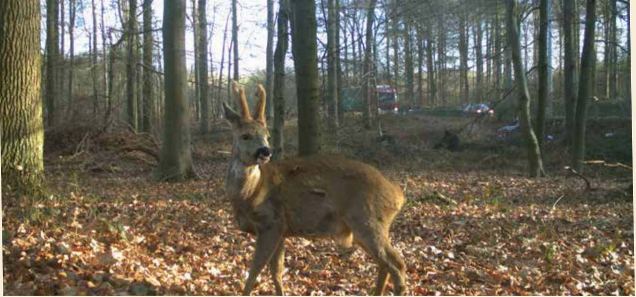
Deer along R0 at racecourse Groenendaal

The open plain on top of the bridge also makes the ecoduct accessible to larger mammals such as deer, which by nature are rather shy and like to keep an overview.