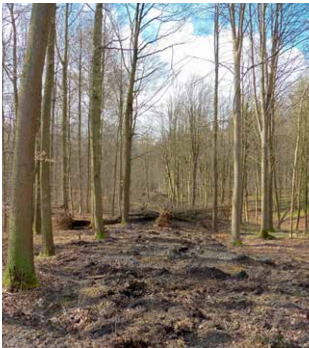
A road under structure in the vicinity of Ecoduct Groenendaal

In other places, implementing defragmentation measures also coincided with interventions in the field of recreational management. The two parking zones along the Brussels Ring (kilometre 17) also disappeared in April 2018. The paving was removed, earthworks were carried out and a forest edge was planted. The eco grid was then placed in such a way that the forest was no longer accessible from the motorway, in contrast to the past. This also applies to several access roads along the R0 and E411 that were closed in the period May 2017 - May 2018 by installing the eco grid (whether or not in combination with an earthen embankment or a service port). The former road signalling and barriers were also removed.