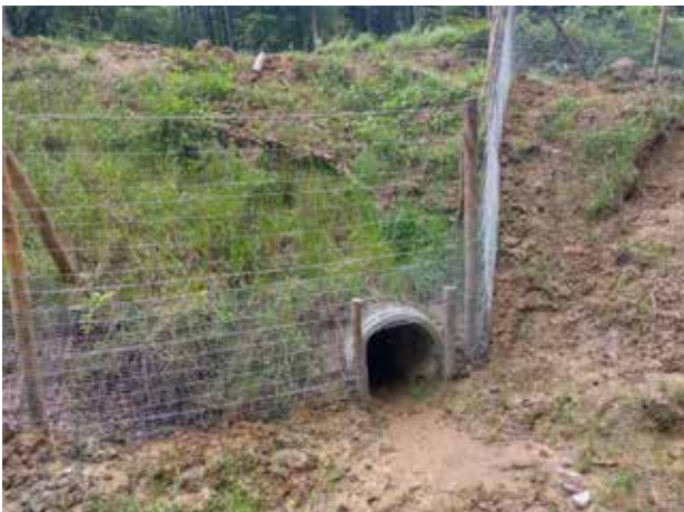
Fauna tube South

Faunabuis Noord, a newly constructed fauna tube, was monitored over a period of 3.5 years from September 2014 to March 2018 with two cameras. During this period several species were observed including fox, polecat and stone marten. The environment was also monitored for two years in 2015 and 2016 with snake plates and insect traps. Here, among other things, brown frog and common toad were observed. In addition, several beetles were also spotted: Carabus auronitens , blue ground beetle and Carabus attenuatus .