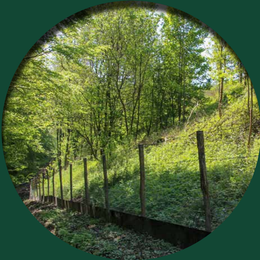
Ecofence next to R0