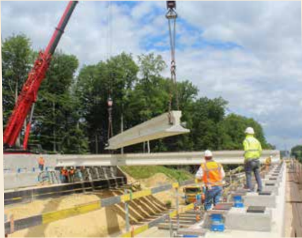
Fitting supporting beams

The result was a bridge deck of approximately 3,000 m 2 : 60 metres wide and 50 metres long. The edges of the bridge deck were trimmed with yellow ornamental border elements. The colour refers to the local sandy soil, which is characteristic of the Sonian Forest.