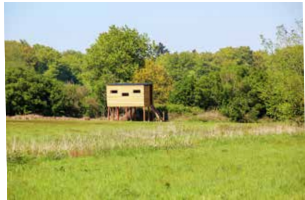
Viewing cabin at Groenendaal racecourse

As previously mentioned it in this report: we count on the sense of responsibility and good will of recreational users not to enter the ecoduct. In the vicinity of Ecoduct Groenendaal, forest paths were broken up and extended with the intention of keeping visitors at a distance from the entrance of the ecoduct. The grazing block on the racecourse also serves to keep visitors at a distance from the bridge. Here is a new viewing cabin with a view of the entrance of the ecoduct and the grazing block. Information panels in the viewing cabin inform visitors about the OZON project.