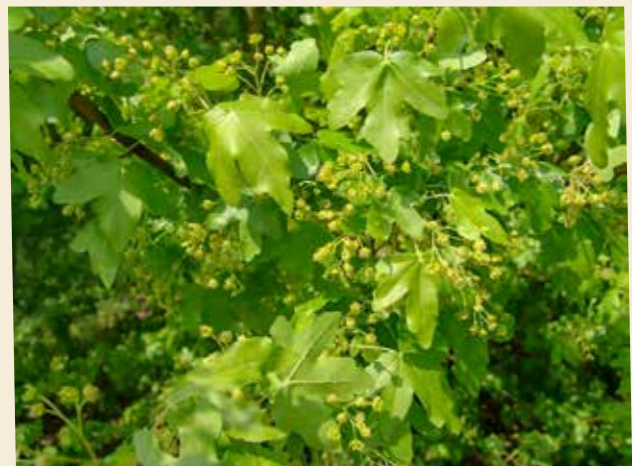
The flowers and fruits of the field maple are popular with bees and other insects and bird species

In 2017 and 2018 approximately 10,500 shrubs and trees were planted in the vicinity of the ecoduct. Planted varieties such as guelder rose ( Viburnum opulus ), red dogwood ( Cornus sanguinea ), mountain ash ( Sorbus aucuparia ) and field maple ( Acer campestre ) provide food for insects, birds and mammals. With some help from the Scottish Highlanders, these plants will continue to spread in a natural way over the next few years. For instance, the former racecourse of Groenendaal is evolving further towards a semi-open grass landscape with species-rich forest edges that contribute to the biodiversity of the Sonian Forest.