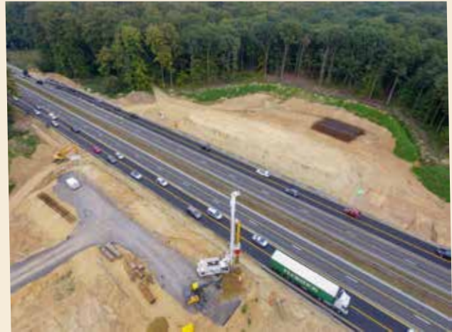
Top view of foundation works, stocked local land and temporary lanes

The first ecoduct on the Brussels Ring is next to the former racecourse of Groenendaal (kilometre 16.4). It was built between May 2016 and May 2018 by BAM Contractors NV in assignment of the AWV and the ANB. The total cost amounted to approximately 6.6 million euro.