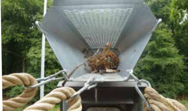
Inside the metal gutter are branches, leaves and nuts for a more natural design

A tree bridge is a kind of walkway for small tree-dwelling mammals such as squirrels and pine marten. These species naturally move through high